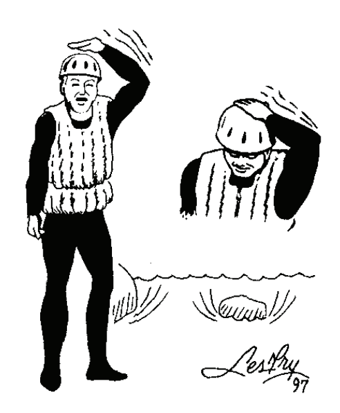
I'm OK: I'm OK and not hurt. While holding the elbow outward toward the side, repeatedly pat the top of your head.