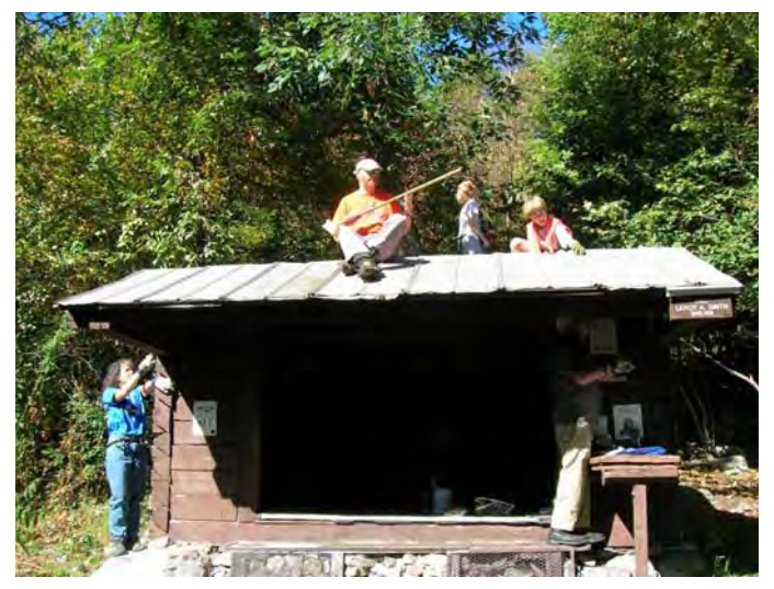
Page 6 Annual Report 2015

Shelter Watch Hours: An average of five hours x 45 trips = 225 hours plus 40 hours chair = 265 hours total. Note that the Chair's increase in hours was due to activities concerning the